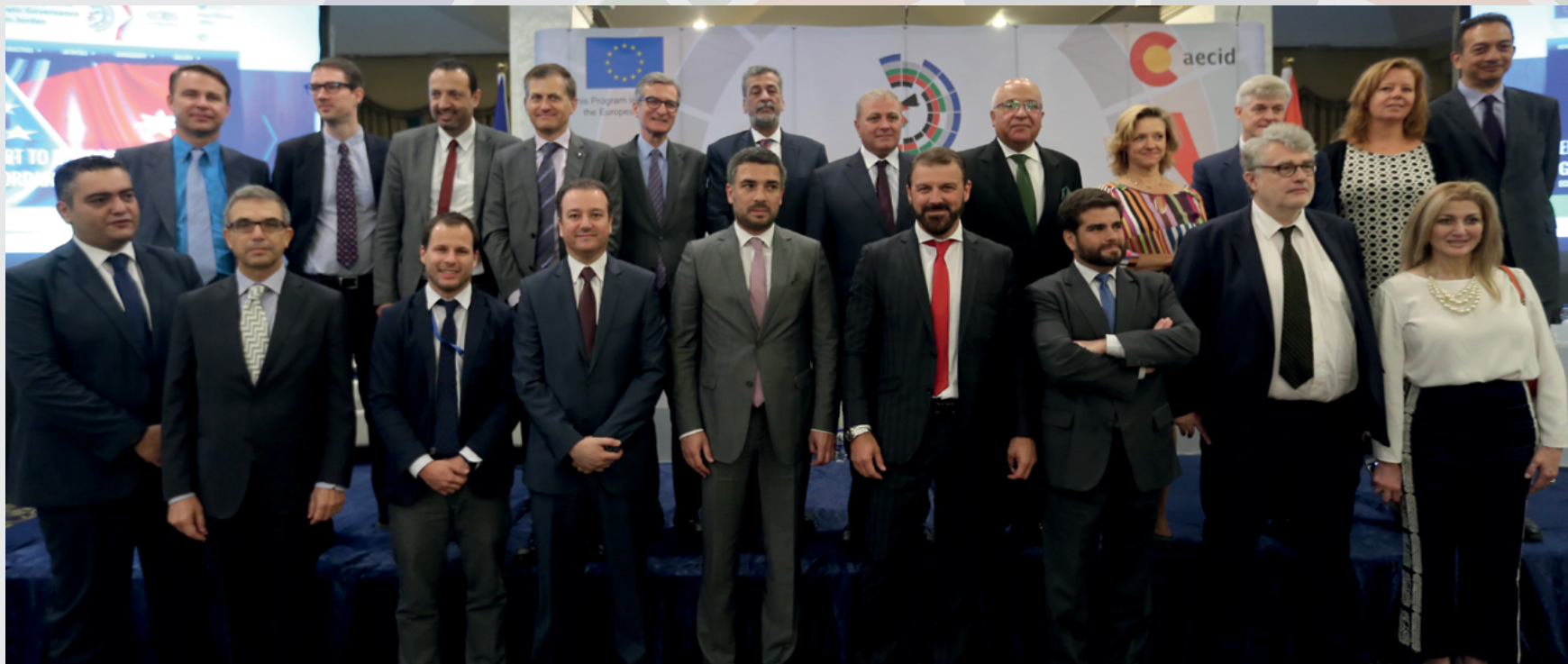
Photo taken during EU-JDID launching ceremony, 24 May 2017

The support of the EU to democratic and electoral processes in Jordan, in place since 2007, was previously implemented through different modalities and interventions. While building on prior accomplishments, the formulation of this Programme also benefited from lessons learned from past EU supported projects, as well as from the recommendations formulated by key local stakeholders concerning content and delivery support mechanisms.