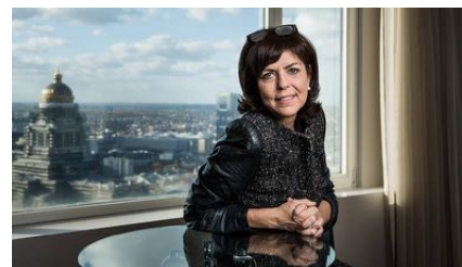
ECES President of Strategic and Advisory Committee, Joëlle Milquet

In September 2020 ECES welcomed in its team Joëlle Milquet, a former Belgium Deputy Prime Minister, former Minister of the Interior , and Special Adviser to President of the European Commission, Jean-Claude Juncker for the compensation of victims of crime.