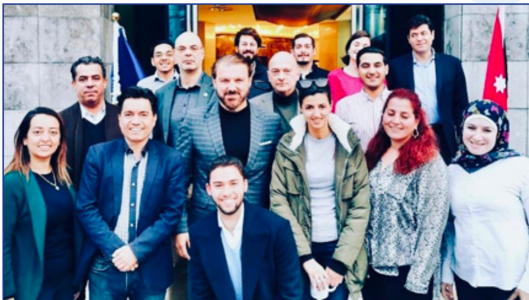
ECES Team in front of ECES office in Jordan (EU-JDID Project)

These guidelines cover everything from audience understanding to social media analytics, going through taking better pictures, writing better words, banner and logo design as well as copyrights and search engine optimisation.