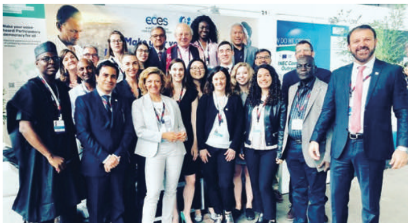
ECES Team during European Development Days 2019

ECES employs a diverse team of highly skilled international, regional and national electoral experts collaborating on its projects, having thus far contracted more than 2000 individuals, representing over 60 different nationalities.