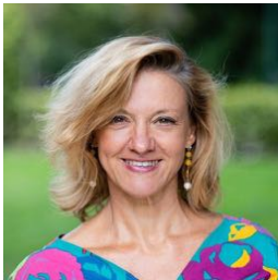
ECES President, Monica Frassoni

experience in European and foreign affairs, proactively contributing in the establishment and successes of ECES also via her regular activity as speaker and lecturer in important academic fora and large public events, focusing on democracy and participation of civil society (notably women and youth, in decision-making at all levels) and also on sustainable energy and energy savings, green transformation of the global economy and society to fight exclusion and climate change.